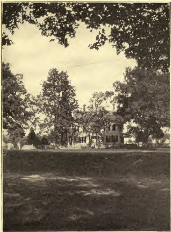
HOUSE WHERE SILL WAS BORN, WINDSOR, CONN., 1841